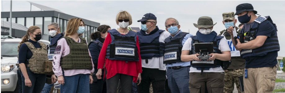
OSCE Secretary General, SMM Chief Monitor and mission members at Novotroitske entry-exit checkpoint in Donetsk region