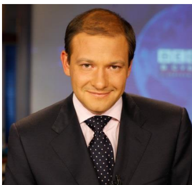
Sergey Brilev Deputy Director General of All-Russia State Television and Radio Broadcasting Company (VGTRK)

Sergey Brilev is a Russian TV anchor, manager and presenter of the Saturday News with the Sergey Brilev program, a member of the Presidium of the Council on Foreign and Defence Policy, deputy director of VGTRK Rossiya Channel, and co-founder and president of the Bering-Bellingshausen Institute. In 1993-1995 he was a special correspondent for the Moscow News international department. In 1995-1996 he was a special correspondent for Vesti, and in 1996-2001 he was the manager of their London office.