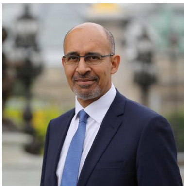
Harlem Désir OSCE Representative on Freedom of the Media

Harlem Désir is the fourth OSCE Representative on Freedom of the Media since the establishment of the Institution in 1997. He was appointed in July 2017 for a period of three years. Previously, he was the French Secretary of State for European Affairs. Before joining the government, he was a Member of the European Parliament for 15 years. The Representative on Freedom of the Media has a mandate to intervene on all media freedom issues in the 57 OSCE participating States, including on individual cases, safety of journalists, imprisonment, but also on legislation and promotion of media pluralism.