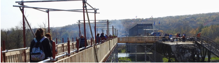
Civilians crossing the temporary bypass bridge near Stanytsia Luhanska