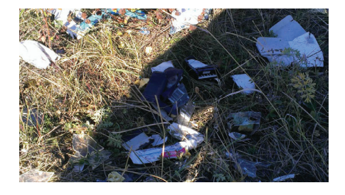
Darkness and Light: Snapshots from the OSCE Special Monitoring Mission to Ukraine _12