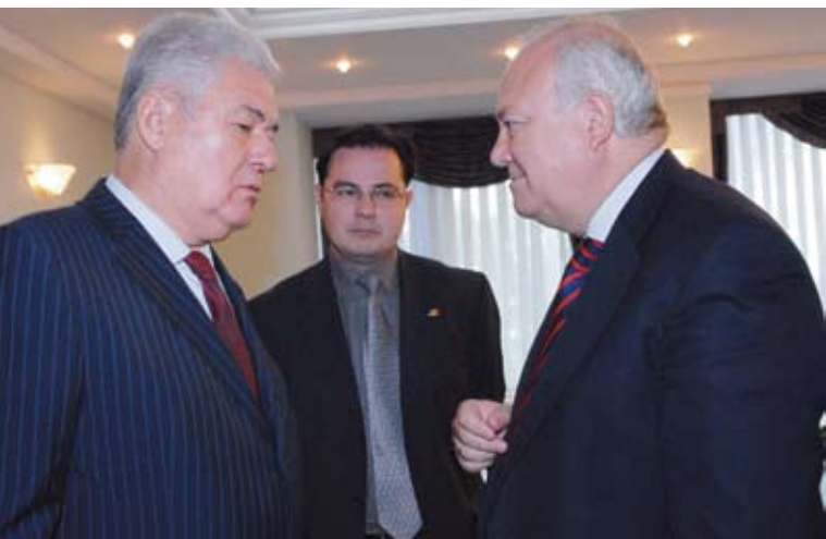
Chisinau, 8 October. President Vladimir Voronin of Moldova and the OSCE Chairman-in-Office exchange views.

In this tour d'horizon of the OSCE, I feel obliged to mention the issue of military security in its most conventional sense — that is, matters concerning arms control and the disarmament regime that supports security in the transatlantic and Eurasian regions.