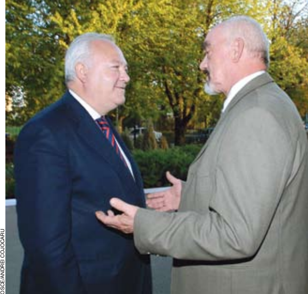
Tiraspol, 8 October. Chairman-in-Office Miguel Ángel Moratinos meets Transnistrian leader Igor Smirnov.

It is true that the OSCE has maintained a neutral position over the years concerning status — a fact acknowledged by all the communities of Kosovo. Being unbiased, however, does not mean being non-committal. Quite the contrary. Although the OSCE is not directly involved in the status negotiations, it