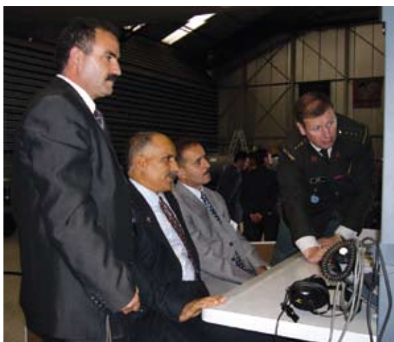
A Belgian military officer briefs experts from Mediterranean Partner Countries on the verification system of the Open Skies Treaty.

The achievement of these goals calls for: