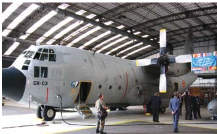
Melsbroek military airbase, Belgium, July 2005. Mediterranean Partners learn all about the role of the Open Skies Treaty in building confidence among States.

We have been meeting more frequently and have been exploring ways and means of translating our priority objectives into more concrete activities.