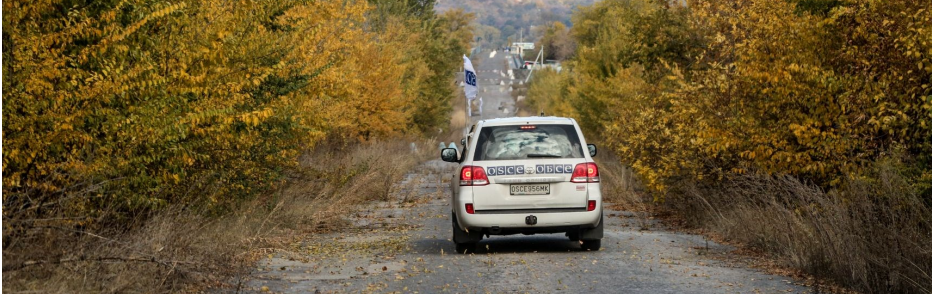
SMM patrol on the road in Luhansk region