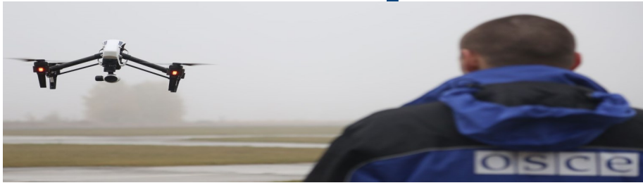
SMM monitoring officer operating a UAV