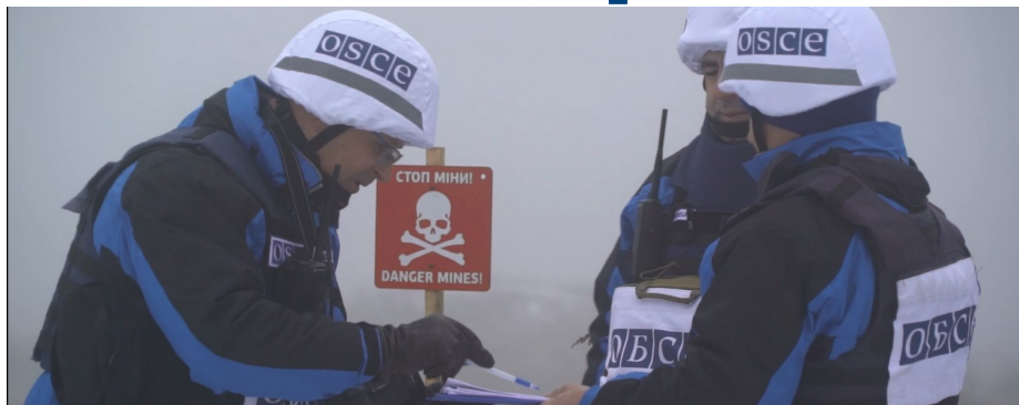
SMM monitoring officers in Luhansk region