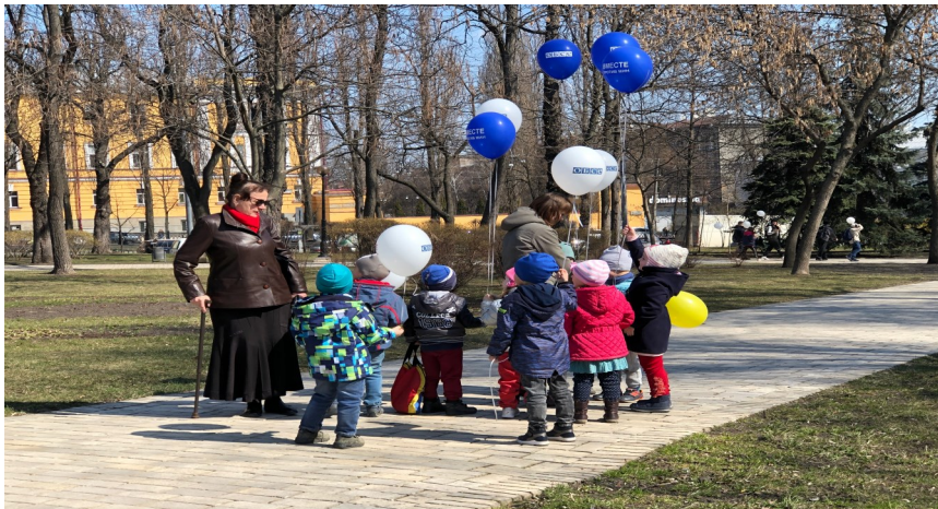
Mine awareness outreach event in Kyiv