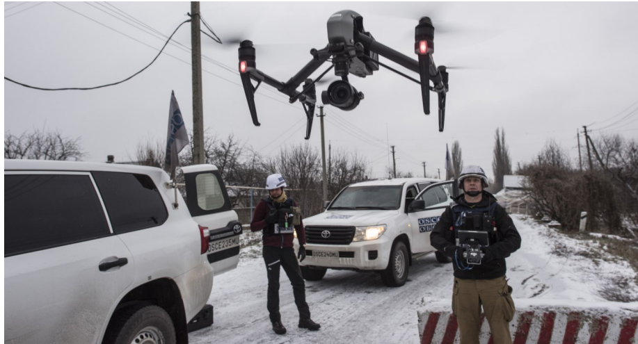
SMM monitoring officer operating a UAV in Donetsk region