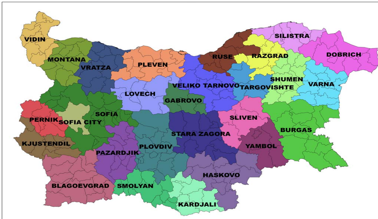
ADMINISTRATIVE DELINEATION OF BULGARIA 28 Administrative districts, 264 municipalities, 6 regions for planning