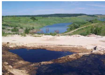
Acid tars dumped in Novy Rozdil, Lviv Region, Ukraine