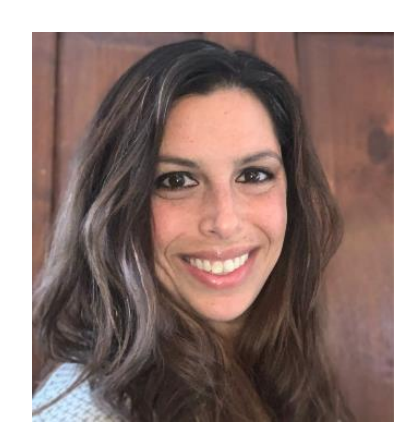
Director for Energy Transformation in the Bureau of Energy Resources at the Department of State, United States