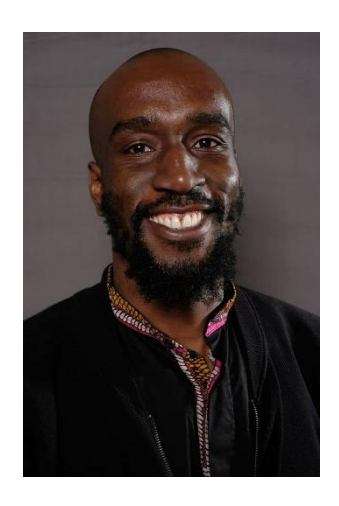
CEO, Mygrants, Italy