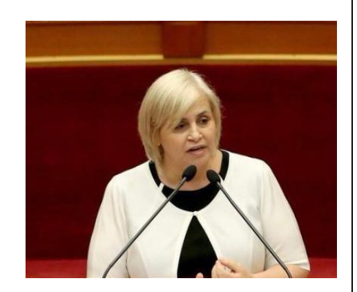
Minister of State for Service Standards, Albania

Ms. Milva Ekonomi, actually serves as Minister of State for Services Standards. From December 2020 to September 2021 she served as Minister of Agriculture and Rural Development, previously (2016-2017) as Minister of Economic Development, Tourism, Trade and Entrepreneurship.