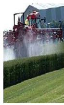
Hazardous Substances Pollution