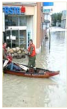
Floods / Droughts