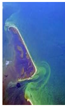
Nutrient / Organic Pollution