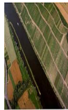
Hydro- morphological Alterations