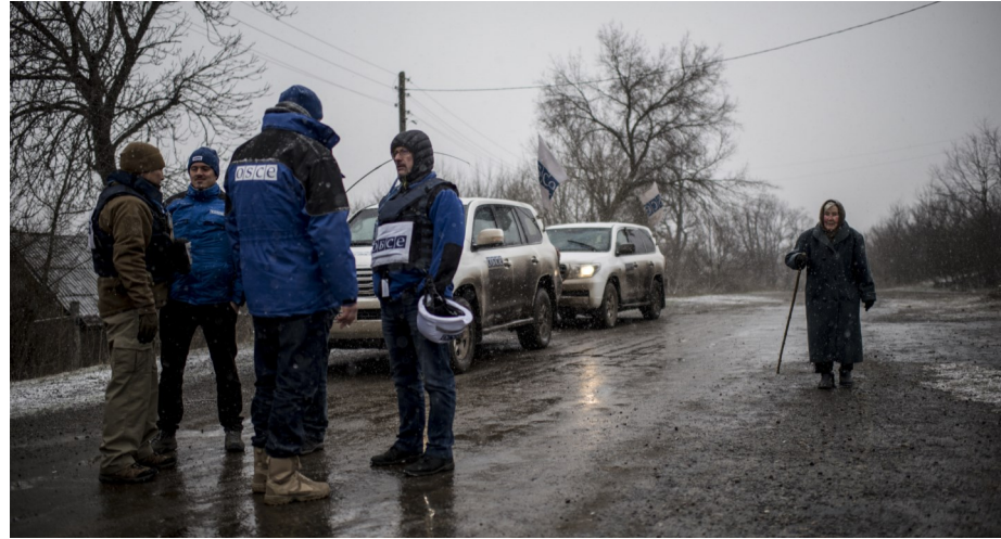
OSCE SMM monitors patrolling in Luhansk region, March 2016.