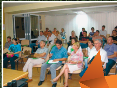
Paraćin - Municipal Assembly