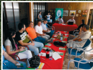
Prijepolje – Cultural Centre