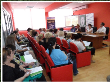
Kragujevac – Business Innovation Centre