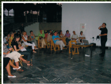
Čačak – Cultural Centre