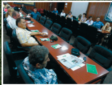
Raška - Municipal Assembly