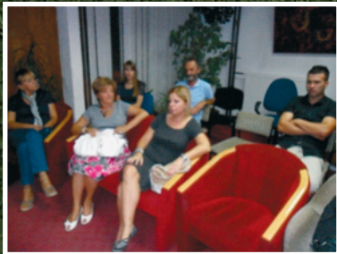
Aranđelovac - Municipal Assembly