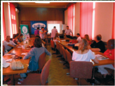
Kruševac – Municipal Assembly