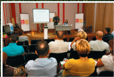
Šabac – Cultural Centre