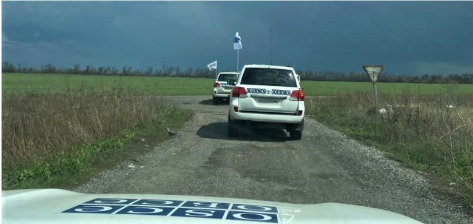
SMM patrol in Donetsk region