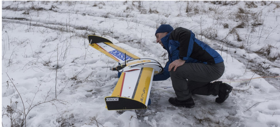
SMM monitoring officer preparing to launch a UAV in Luhansk region