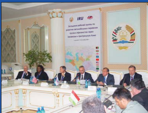
First meeting of the Working Group on Afghan Transit October 19-20, 2009 (Dushanbe, Tajikistan)