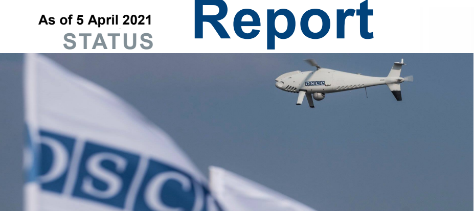
An SMM long-range UAV