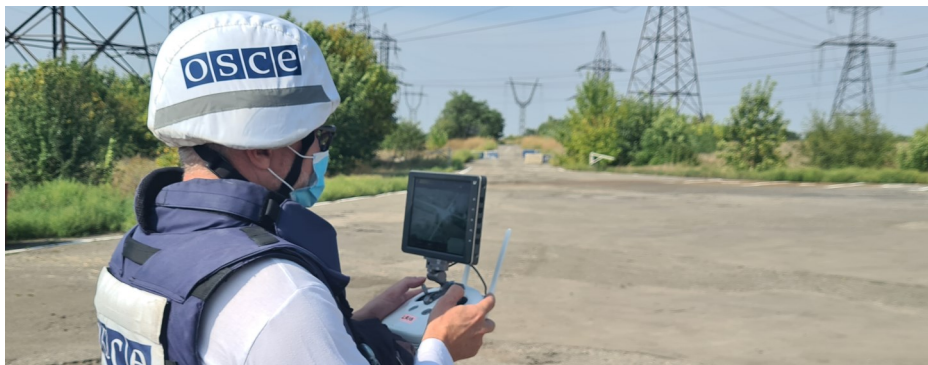
An SMM monitoring officer operating a UAV in Luhansk region