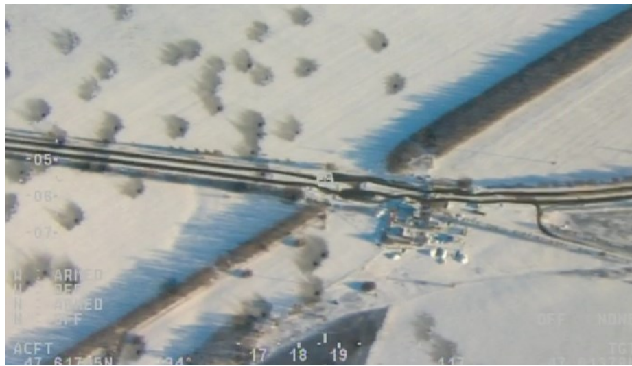
An image taken by the SMM's Unarmed/Unmanned aerial vehicle (UAV) on 14 January 2015, showing shell impact craters at Volnovakha, where a bus was hit on 13 January.