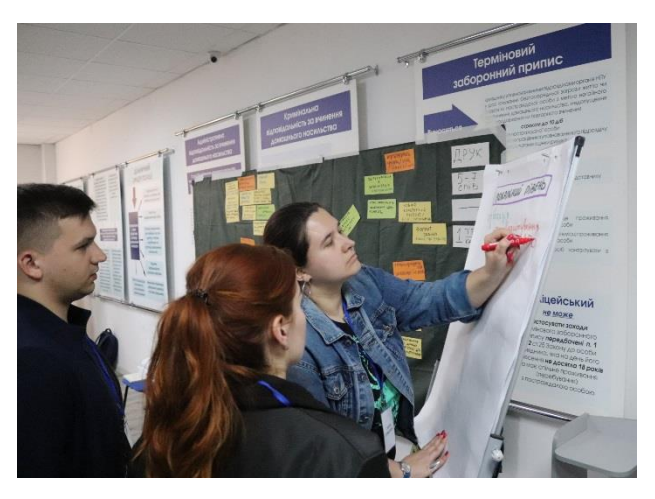
Session 3. Knowledge, skills and competencies that young people need

Based on the discussed areas of youth activities in the post-war period, participants were asked to think about the knowledge / abilities / skills and competencies young people would need when implementing such ideas or proposals. The format of the work was a group brainstorming session, where the proposed ideas were put on a flipchart.