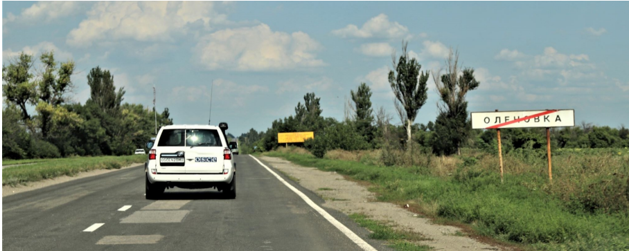
SMM patrol near Olenivka, Donetsk region