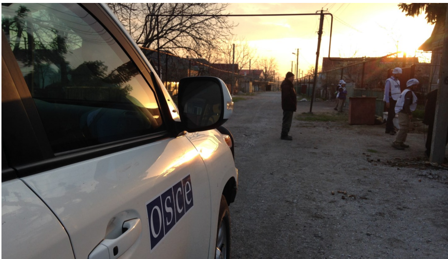
The SMM conducted its first overnight observation in Shyrokyne, 17-18 April 2015.