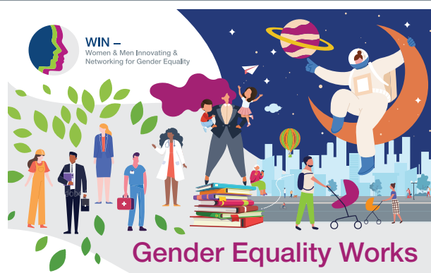
Campaign "Gender equality works", 2021 (OSCE)

WIN introduces innovative and transformative approaches and tools to gender equality in all dimensions of comprehensive security. The WIN project's beneficiaries receive cutting-edge training in key security issues in accessible languages . The WIN Project creates platforms for OSCE-wide exchange of good practices, lessons learned, and knowledge transfer. WIN provides women working in the peace and security opportunities to participate in mentoring programmes, trainings, regional and cross-regional exchanges, and mutual learning from OSCE experts and peers.