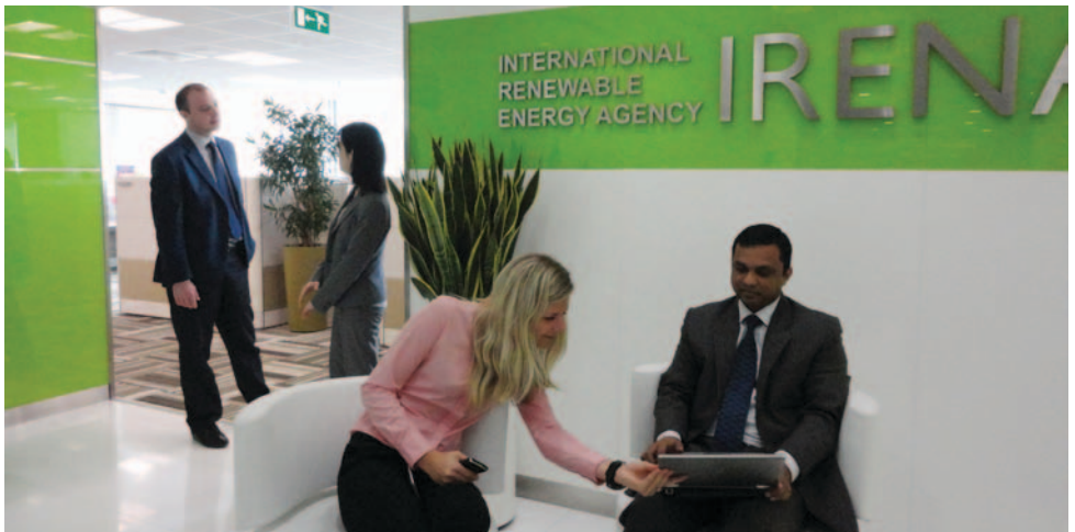
Members of the IRENA team in Abu Dhabi

In the performance of its activities, IRENA acts in accordance with the purposes and principles of the United Nations to promote peace and international cooperation, and in conformity with policies of the United Nations aimed at furthering sustainable development.