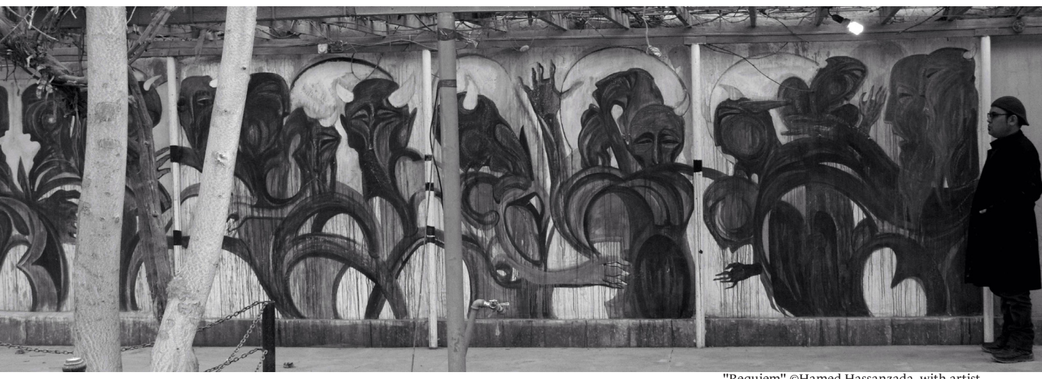
"Requiem", with artist