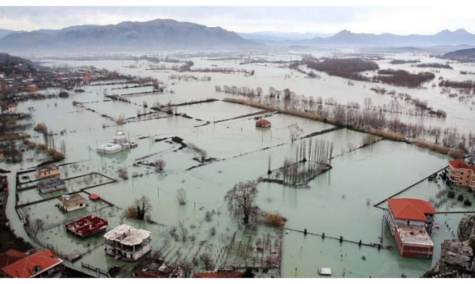
Flooding in the Novosela commune near Vlore, Albania, January 2016

Matters of concern might be local, like pollution from a garbage dump, or national, like a new draft law on environmental protection. Or, as in the case of transboundary waterways, they may transcend state boundaries.