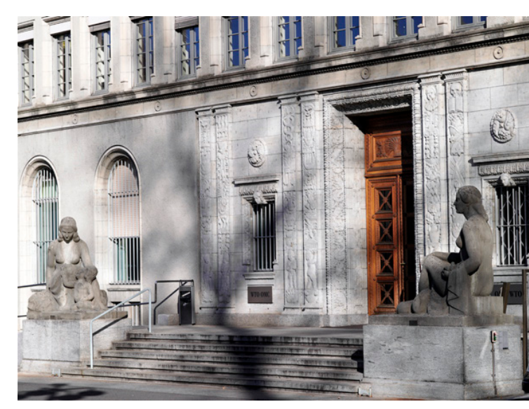
Centre William Rappard, former premises of the International Labour Organization in Geneva, Switzerland, where the CSCE negotiations took place from 1973 to 1974

There were committee meetings for each of the three baskets – on security and the basic principles guiding relations between states (the so-called Helsinki Decalogue), on economic and environmental issues and on humanitarian matters. There were also special working groups, for instance on the Mediterranean and on the non-use of force. Many negotiations were actually conducted in the corridors. There were long coffee breaks which were actually used for informal and bilateral negotiations.