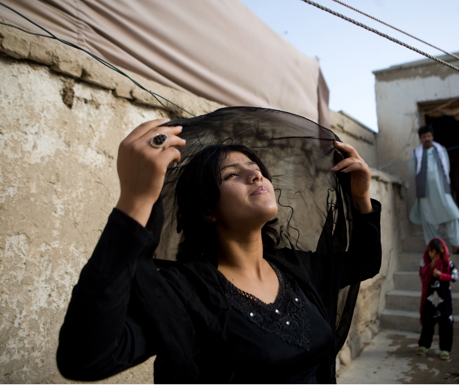
An Afghan girl wears her headscarf before leaving her home in Kabul, Afghanistan, 2009.