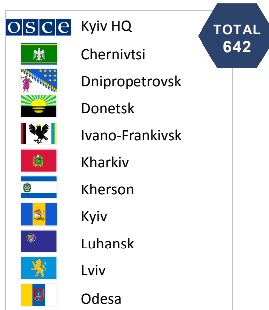
SMM teams are deployed to ten locations in Ukraine. The head office is in Kyiv.