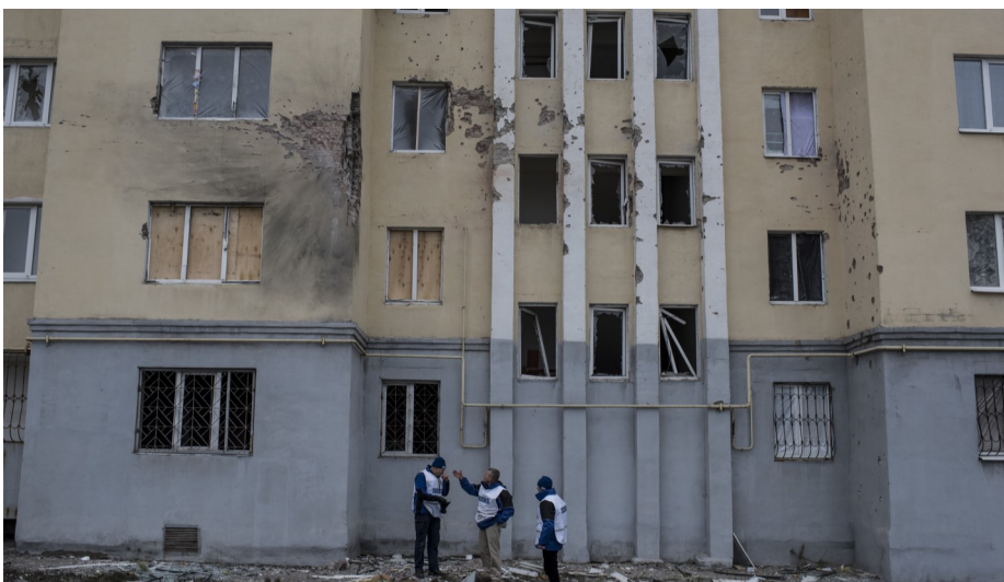
The SMM monitors assessing the impact of shelling in Mariupol, January 2015.