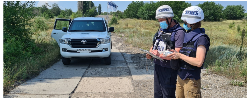
SMM patrol launching a UAV in Luhansk region