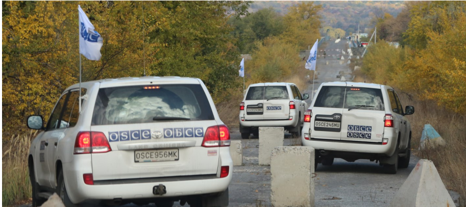
The SMM near Zolote in Luhansk region