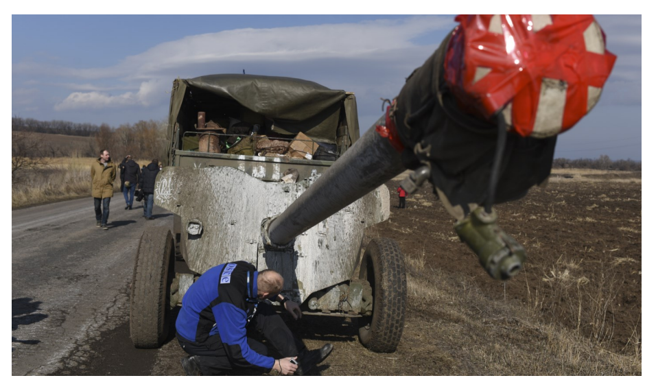
The SMM monitoring the movement of heavy weaponry in eastern Ukraine, February 2015.