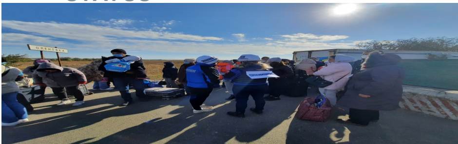
OSCE SMM with civilians at Olenivka