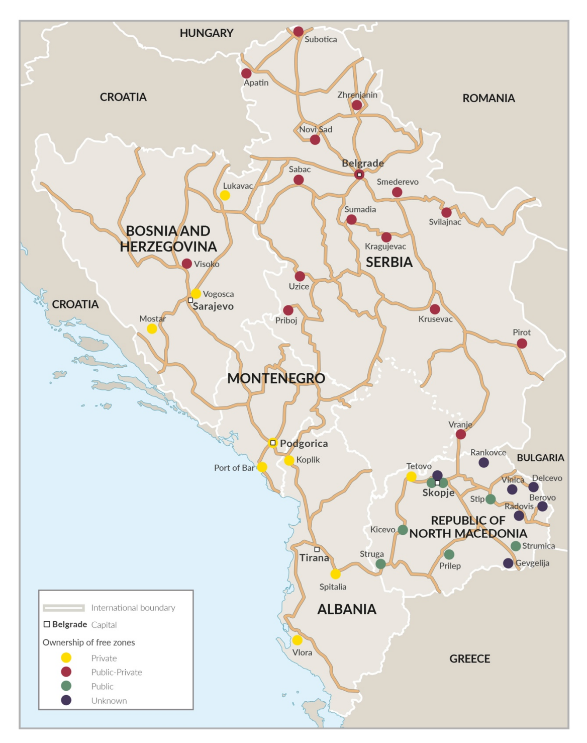
FIGURE 2 Free zones across the focus countries.