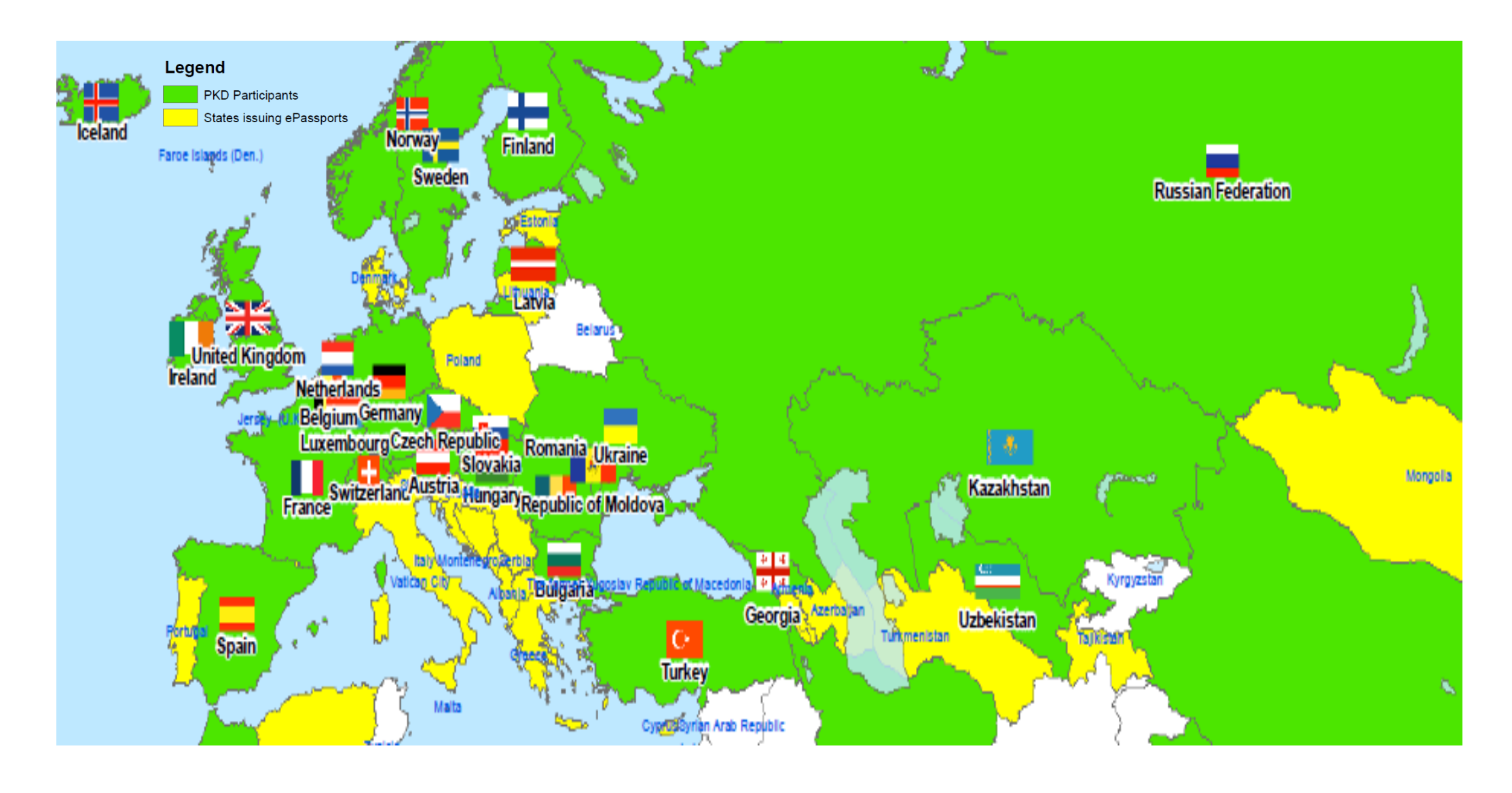
Annex 2 - Magnified section of ICAO PKD Membership Map in the OSCE Region