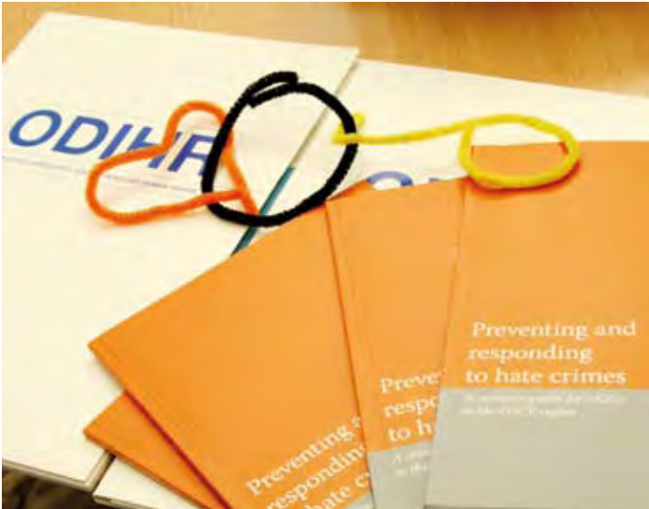
Drawing inspiration from the resource guide “Preventing and responding to hate crimes”, participants in an ODIHR training seminar practised useful techniques for conducting workshops on combating hate crimes, Warsaw, September.