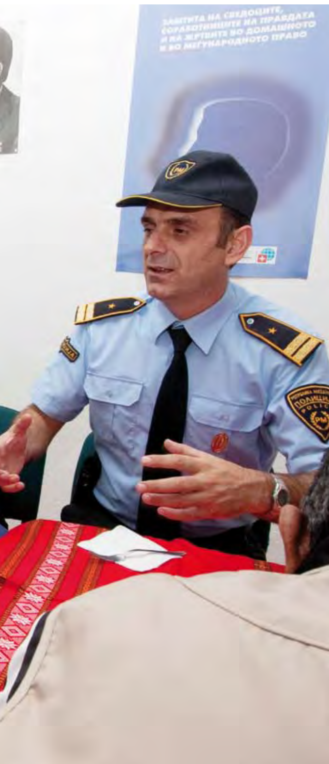
A police officer talks with representatives of the Roma community about their concerns, Skopje, 7 September.

Ministerial Council Decision No. 8/09, “Enhancing OSCE Efforts to Ensure Roma and Sinti Sustainable Integration”, adopted in Athens in December 2009, focuses on enhancing OSCE efforts to ensure integration of Roma and Sinti. The Ministerial Council has tasked ODIHR, in co-operation and co-ordination with the High Commissioner on National Minorities (HCNM), the OSCE Representative on Freedom of the Media and other relevant OSCE executive structures, to continue to assist participating States in combating acts of discrimination and violence against Roma and Sinti, and to counter negative stereotyping of Roma and Sinti in the media. Furthermore, it tasked ODIHR, in consultation with the participating States and in close co-operation with other relevant OSCE institutions, to develop and implement projects addressing the issue of early education for Roma and Sinti. Implementing the Ministerial Council Decision will be a priority for ODIHR in 2010.