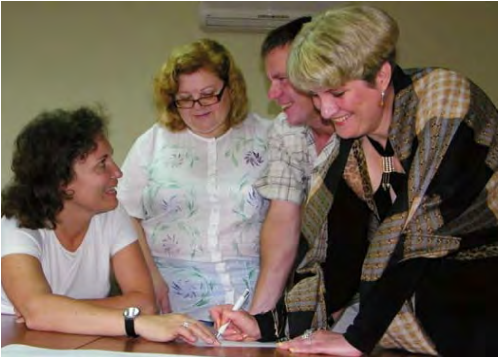
Participants at a training session on human rights education and civic participation for Belarusian civil society representatives, Lviv, Ukraine, 9 July.

which are the areas in which these individuals and groups face the gravest challenges.