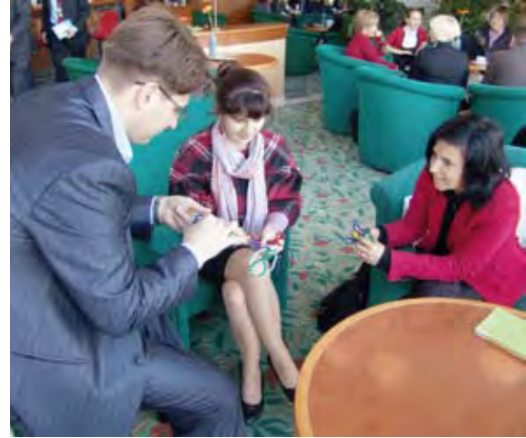
Participants in an ODIHR-organized training seminar on hate crimes, Warsaw, 5 September.

need to further train police on how to recognize and investigate hate crimes.