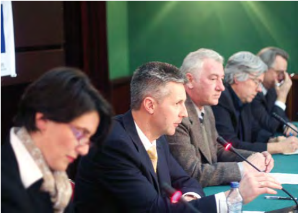
Artis Pabriks, former Foreign Minister of Latvia and head of the OSCE/ODIHR Election Observation Mission to Montenegro (centre), speaks to journalists at a post-election press conference with colleagues from parliamentary delegations, 30 March.

the end of 2009, the Office was in the process of updating or developing publications on a wide variety of issues, including the participation of national minorities in electoral processes, legal frameworks for elections, new voting technologies, voter registration, campaign finance and guidelines on media monitoring.