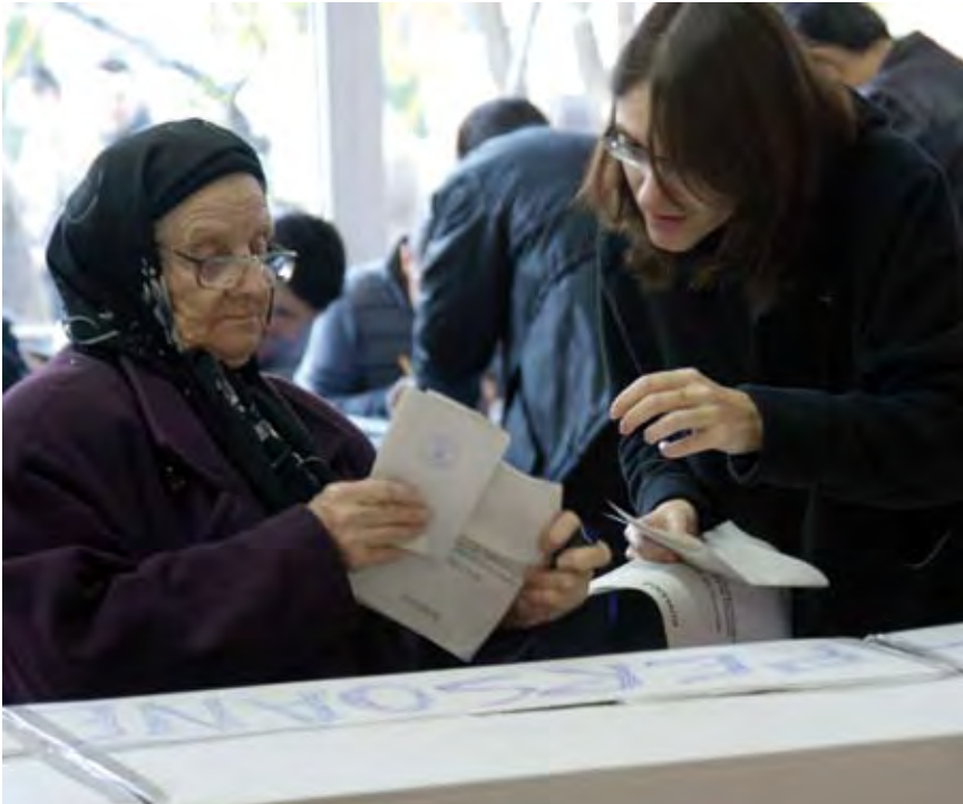
A voter preparing to cast her ballot during the Romanian presidential election, Bucharest, 22 November.