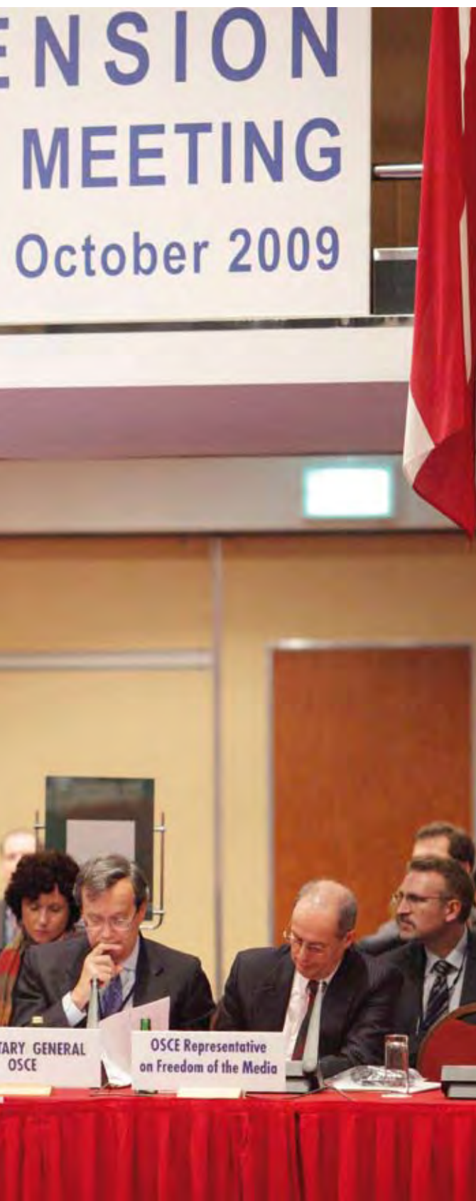
The 2009 Human Dimension Implementation Meeting took place at the Sofitel Hotel, Warsaw, 28 September – 9 October.

Monitoring and assessing the compliance of participating States with their commitments in the area of human rights and assisting them with the implementation of these commitments are core activities for ODIHR. Implementation remains a challenge in many areas and, in co-operation with numerous partners, including governments, civil society and international organizations, the Office continues to address key issues in this area. In so doing, ODIHR combines a thematic focus with a comprehensive approach to monitoring, reporting on and enhancing the implementation of human rights commitments.