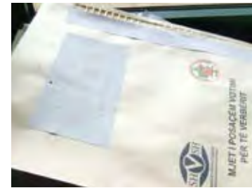
Ballot papers for blind voters at a polling station during Albania's parliamentary elections, Elbasan, 28 June.

access to certain media sources or are granted access in a manner that is inequitable.