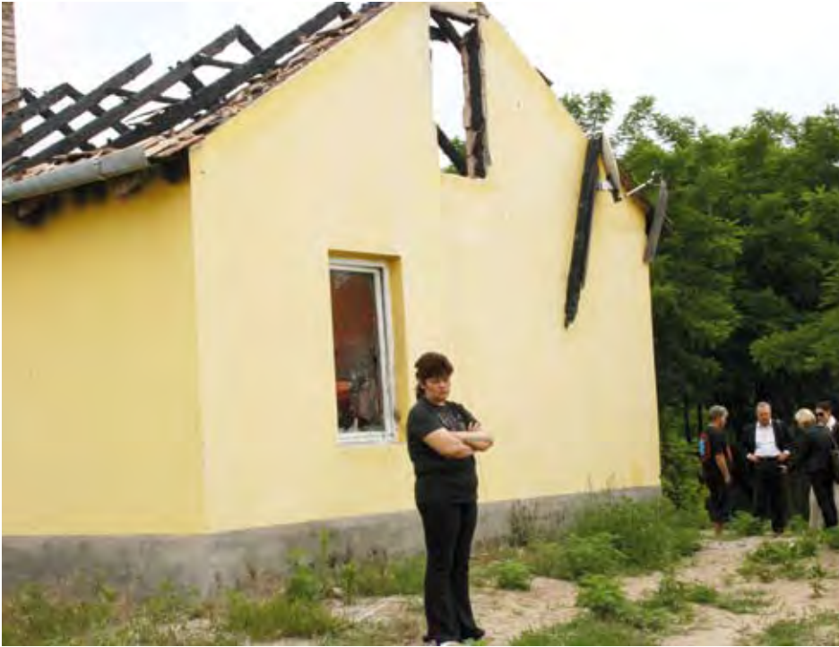
An ODIHR delegation outside a destroyed Roma home in the village of Tatárszentgyörgy during a field-assessment visit to Hungary, 27 June.

— have perpetuated the inequality, social exclusion and, sometimes, hatred that these communities face.