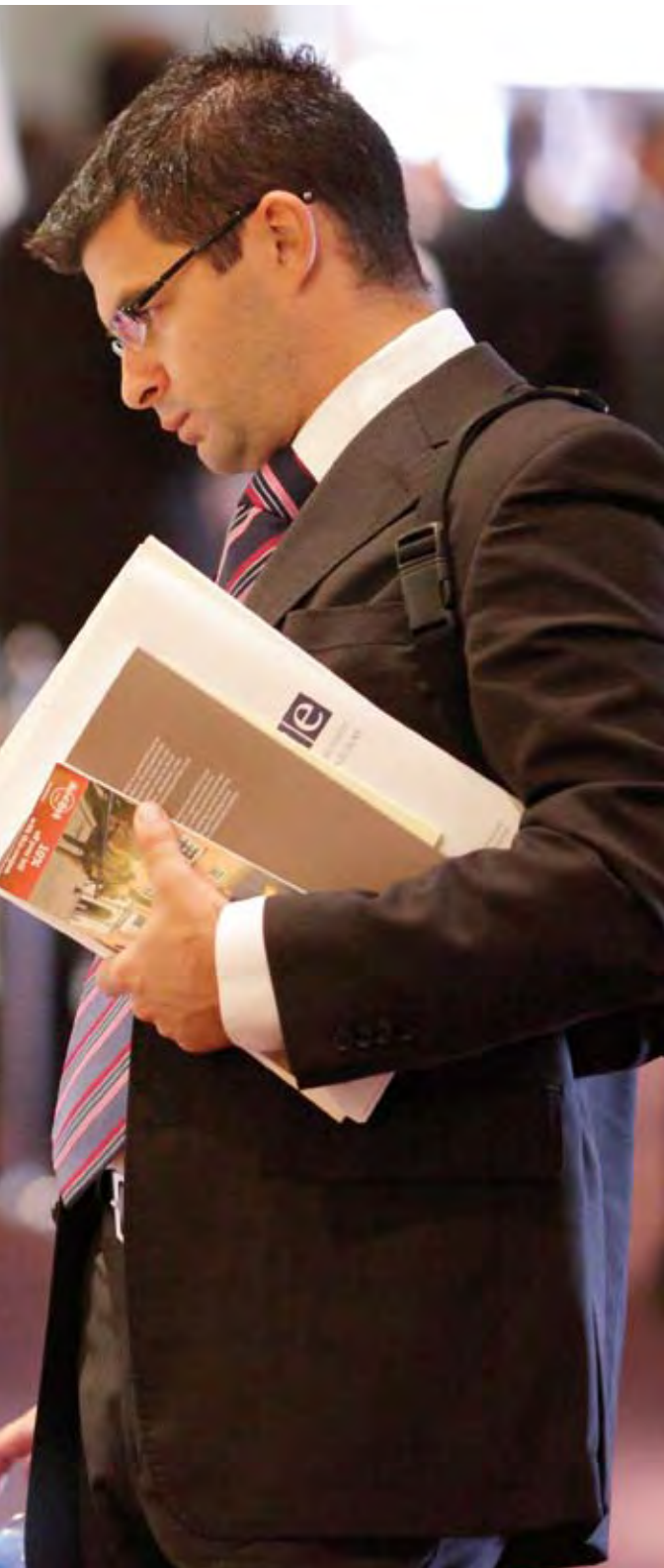
A participant at the Human Dimension Implementation Meeting, Warsaw, 28 September - 9 October.

OSCE participating States have undertaken numerous commitments to combat racism, xenophobia, anti-Semitism and other forms of intolerance, including against Muslims, Christians and followers of other religions. Despite this, violations of human rights and fundamental freedoms continue to threaten stability and security throughout the OSCE region. Accordingly, ODIHR works with participating States and a broad network of non-governmental bodies to defend freedom of thought, conscience, religion and belief and to eliminate manifestations of intolerance in order to build cohesive communities in which diversity and pluralism are seen as assets to democratic and pluralistic societies.