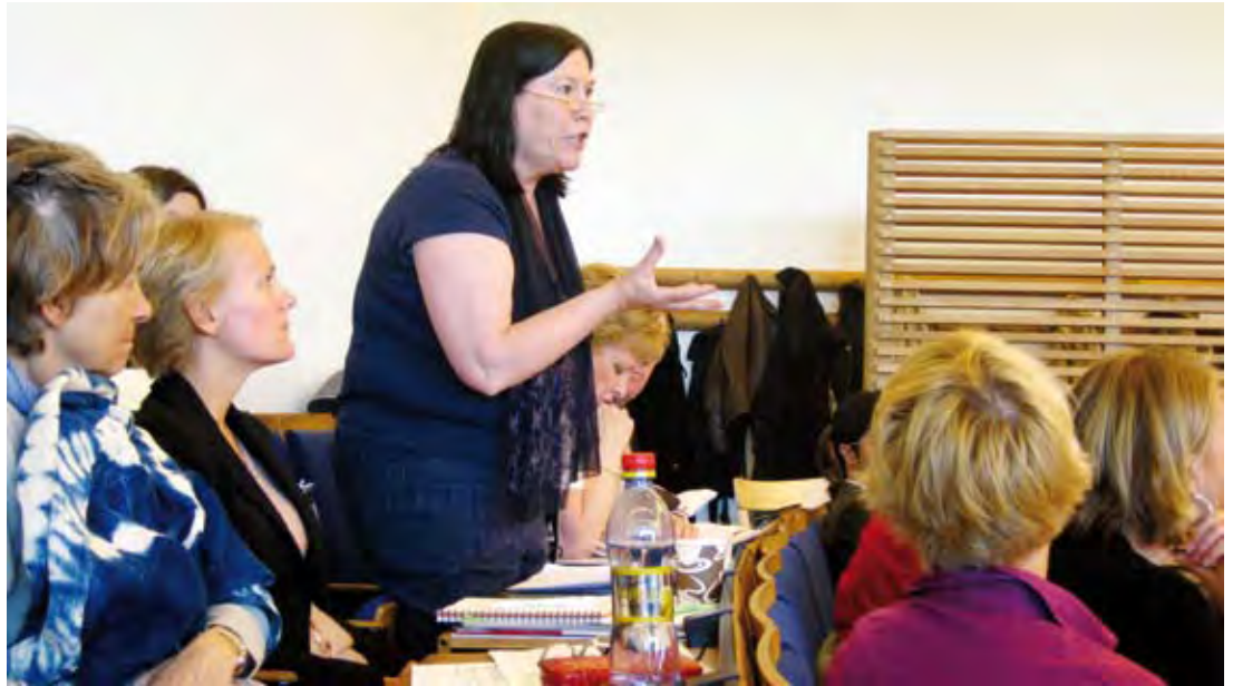
An NGO representative from Northern Ireland at the “1325: Women Negotiating Peace” international conference in Reykjavik, Iceland, 19 June.

2009, ODIHR began consultations with field operations and other key stakeholders on the design and construction of a future online repository.