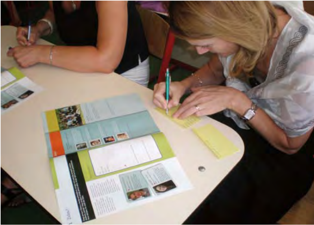
Training for Croatian teachers on using ODIHR's Teaching Materials to Combat anti-Semitism, Split, Croatia, 2 September.

pioneering “Law Enforcement Officer Programme on Combating Hate Crime”, a comprehensive training initiative covering various aspects of hate crimes and police responses to them. The training programme was also conducted in Legionowo, Poland, in November, where 19 police officers from eight of the country’s regions took part. The main focus of the training was to provide the participants with theoretical knowledge and practical skills so that they can pass the information down to front-line police officers in various follow-up training courses that are expected to be held at the regional level.