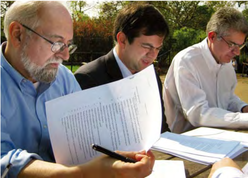
Members of the ODIHR Core Group of Experts for drafting the Guidelines on Legislation Pertaining to Political Parties meeting in London on April 9.