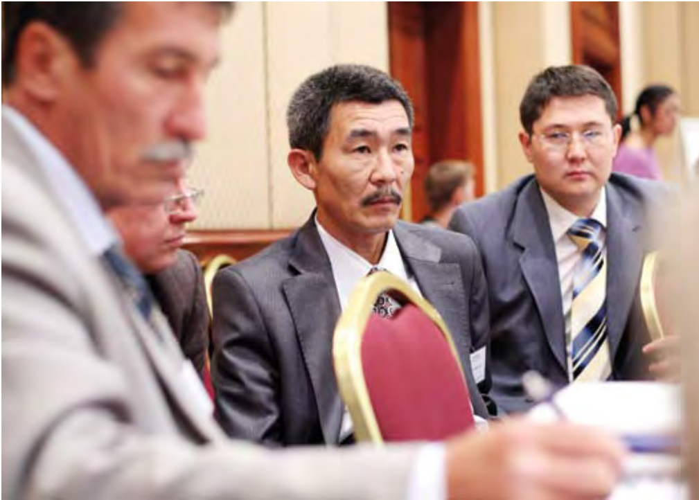
Participants in an OSCE roundtable meeting on freedom of association in Central Asia, Bishkek, 21 October.

States will find it difficult, if not impossible, to fulfil their OSCE commitments. Thus, ODIHR provides support to participating States to help them foster and sustain democratic institutions, such as political parties and parliaments.