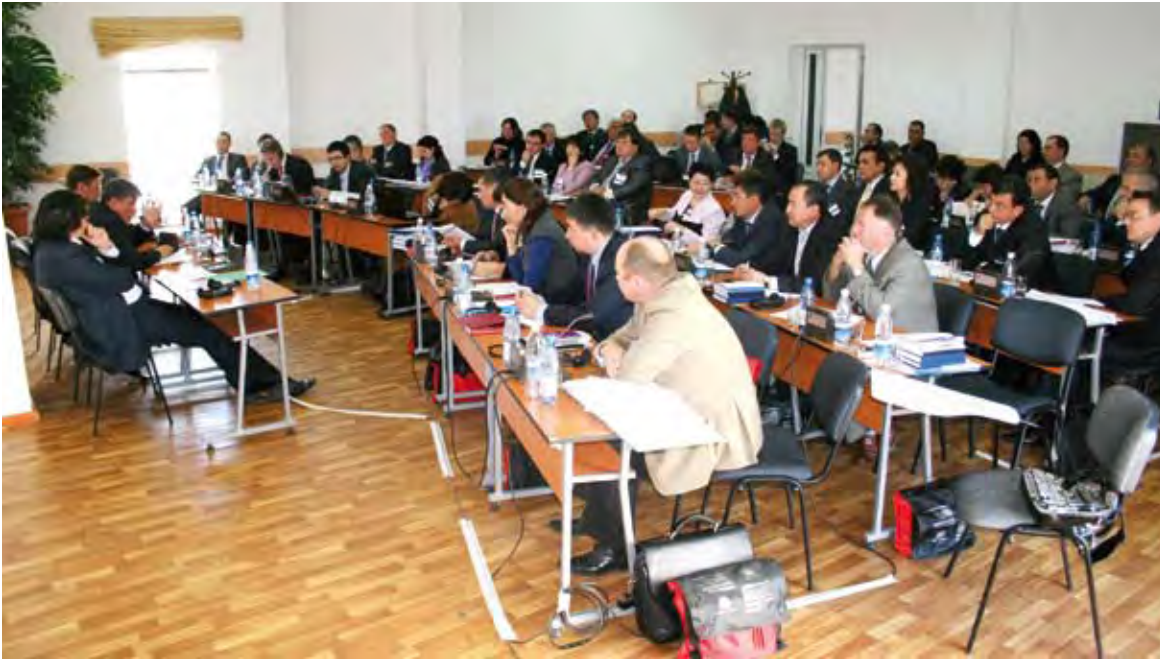
Participants attending the fourth annual ODIHR Expert Forum on Criminal Justice for Central Asia at Issyk-Kul, Kyrgyzstan, on 15 October.