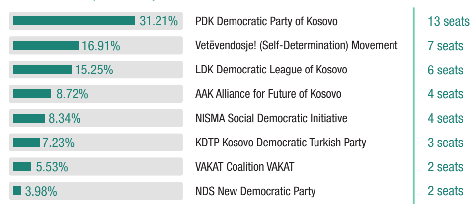
The 2017 municipal assembly election results were as follows:

The total number of voters in Prizren municipality registered for the municipal elections held in 2017 ( 1^{st} round in October and 2^{nd} round in November) was 168,884^{1} , including out-of-Kosovo voters. The voter turnout in 1^{st} round was 40.62% or 68,595 voters and in 2^{nd} round it was 30.94% or 52,255 voters (source: Central Election Commission).